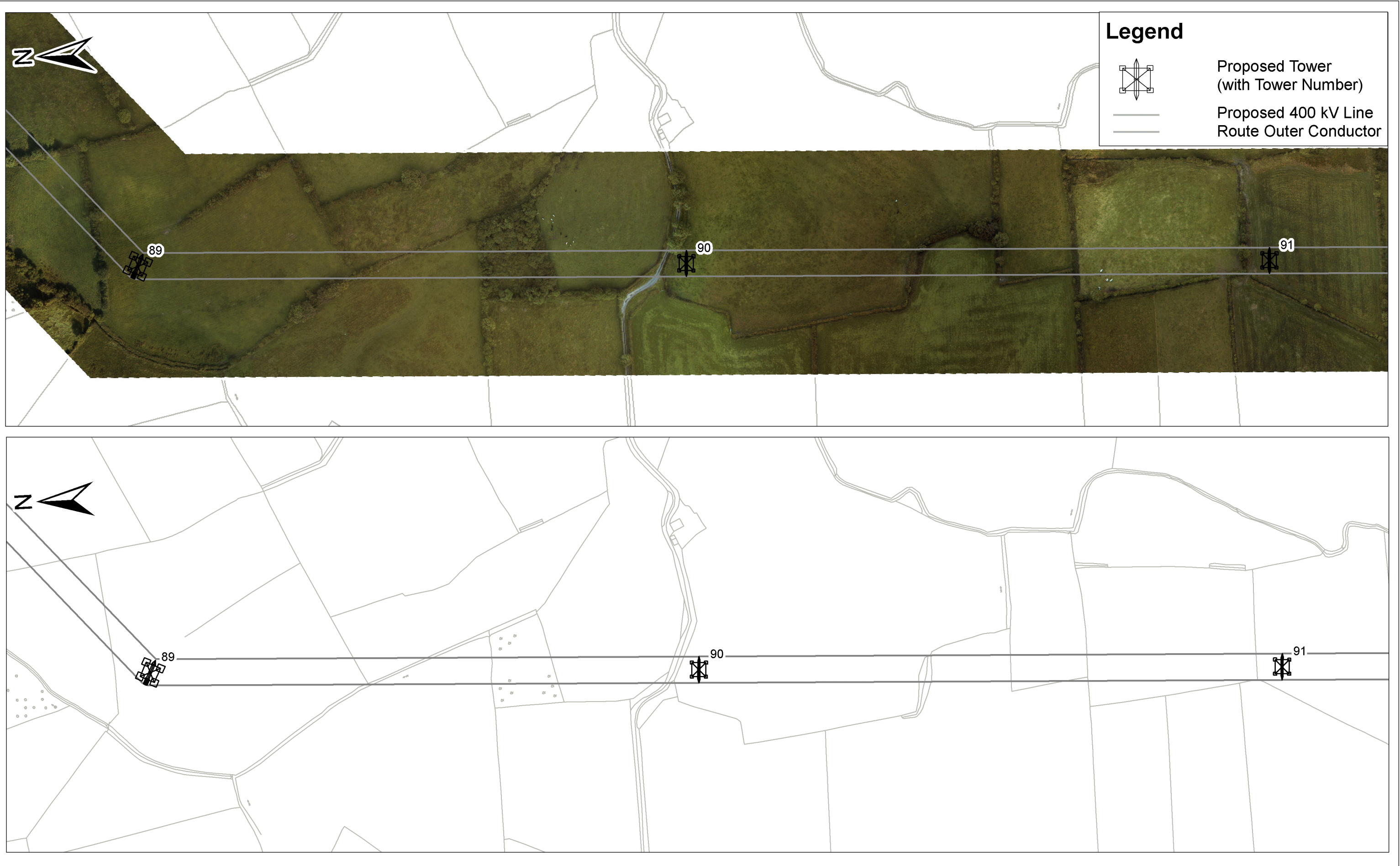
View 2: 1/2,500