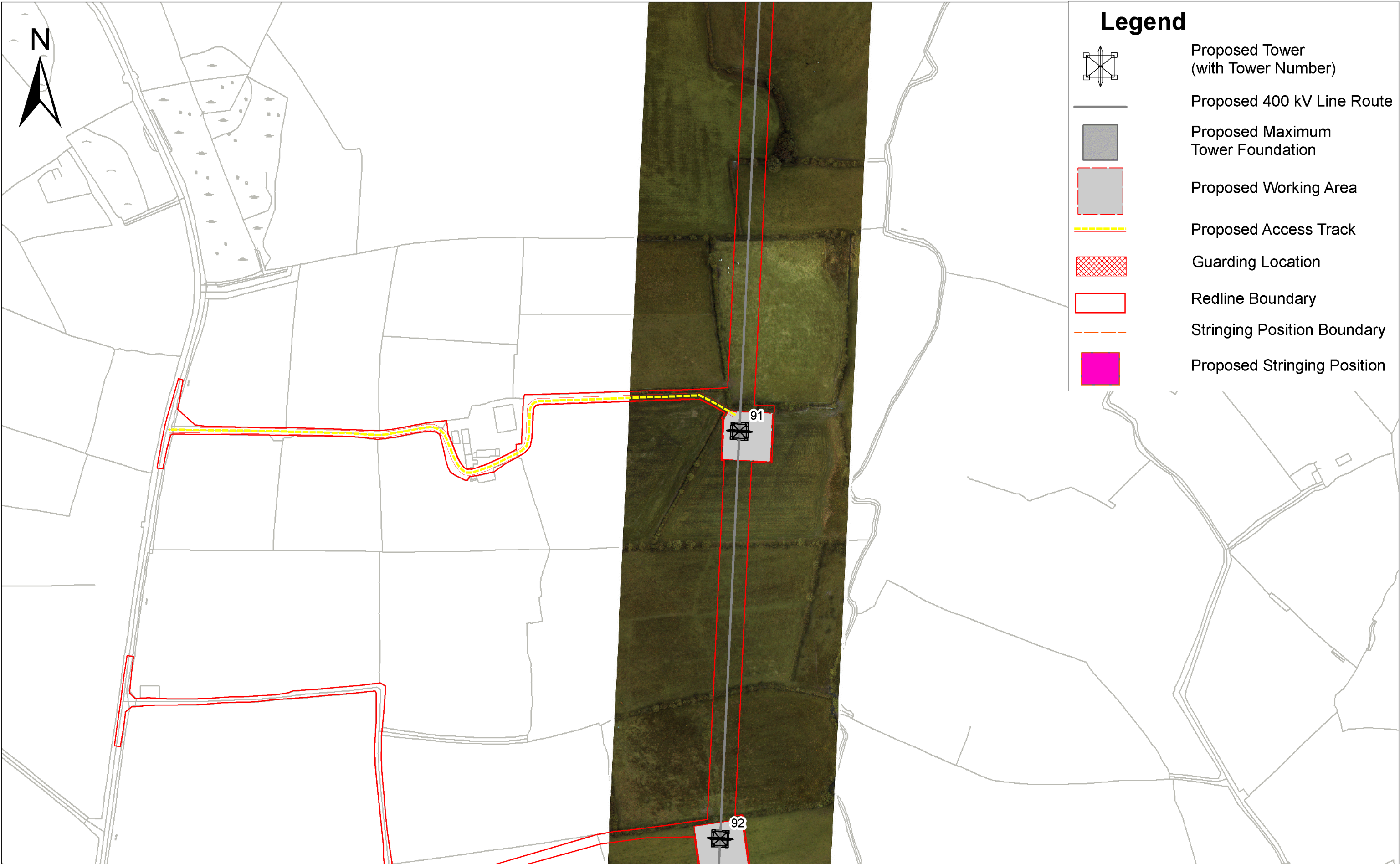
View 1: 1/2,500