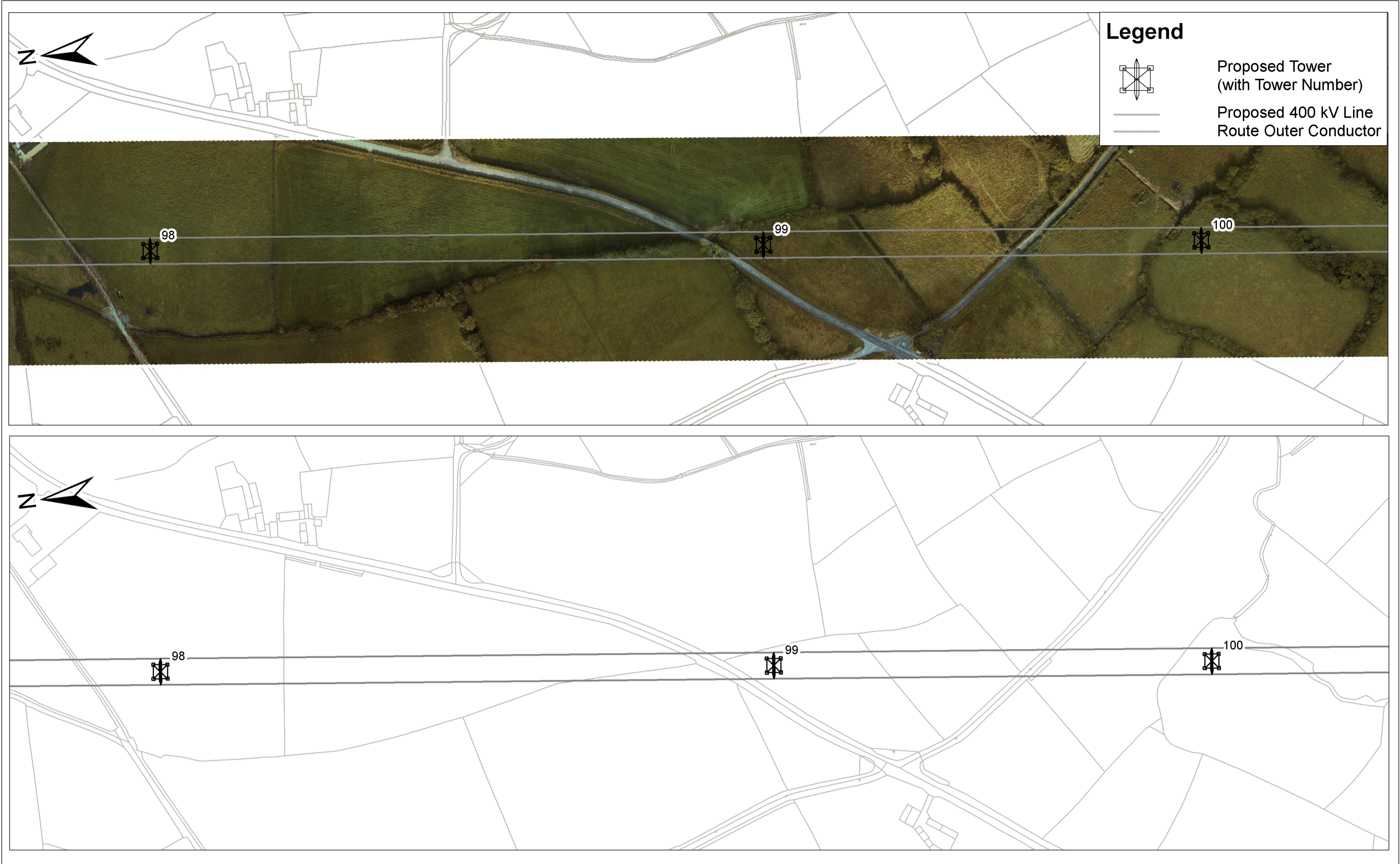
View 2: 1/2,500