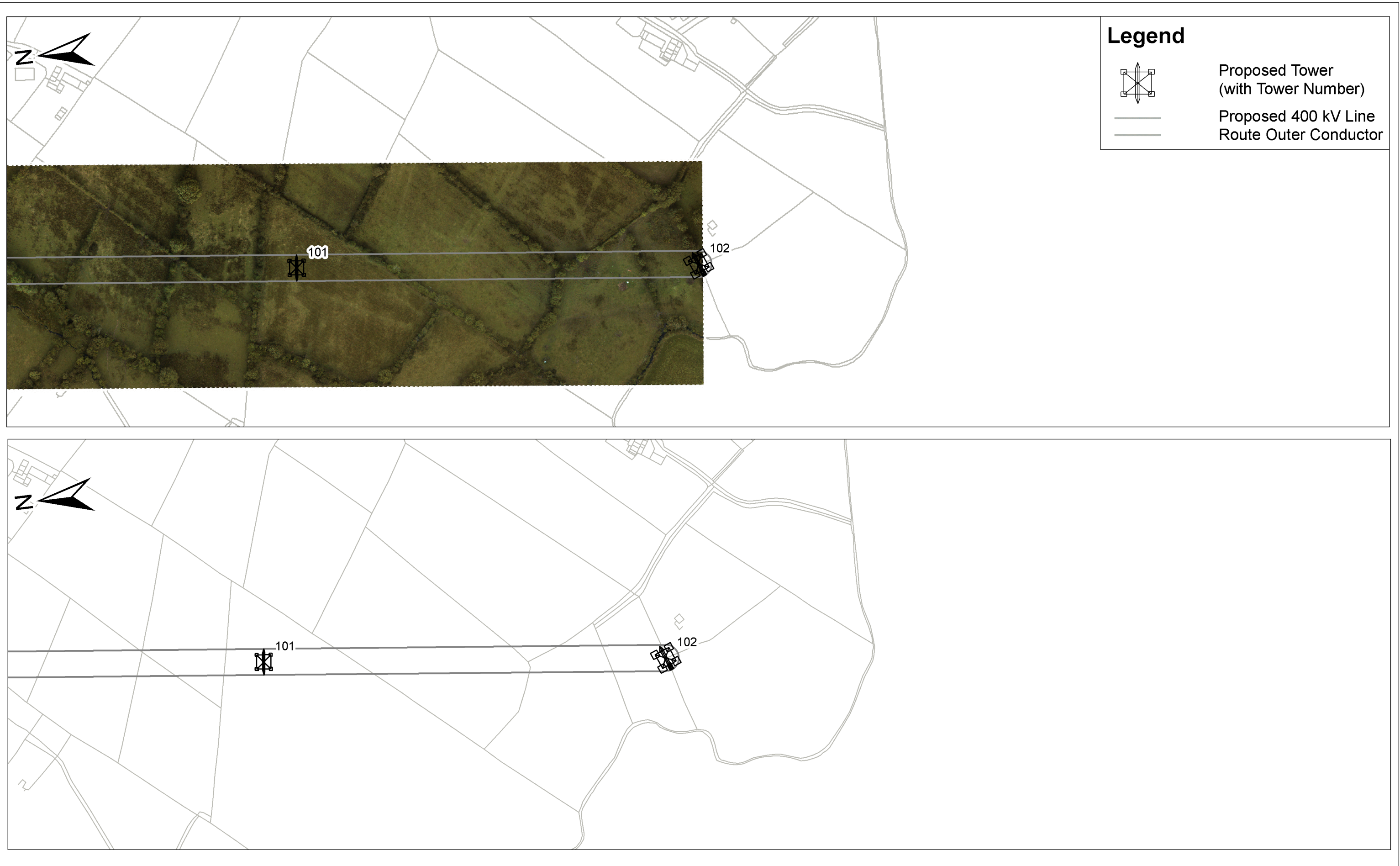
View 2: 1/2,500