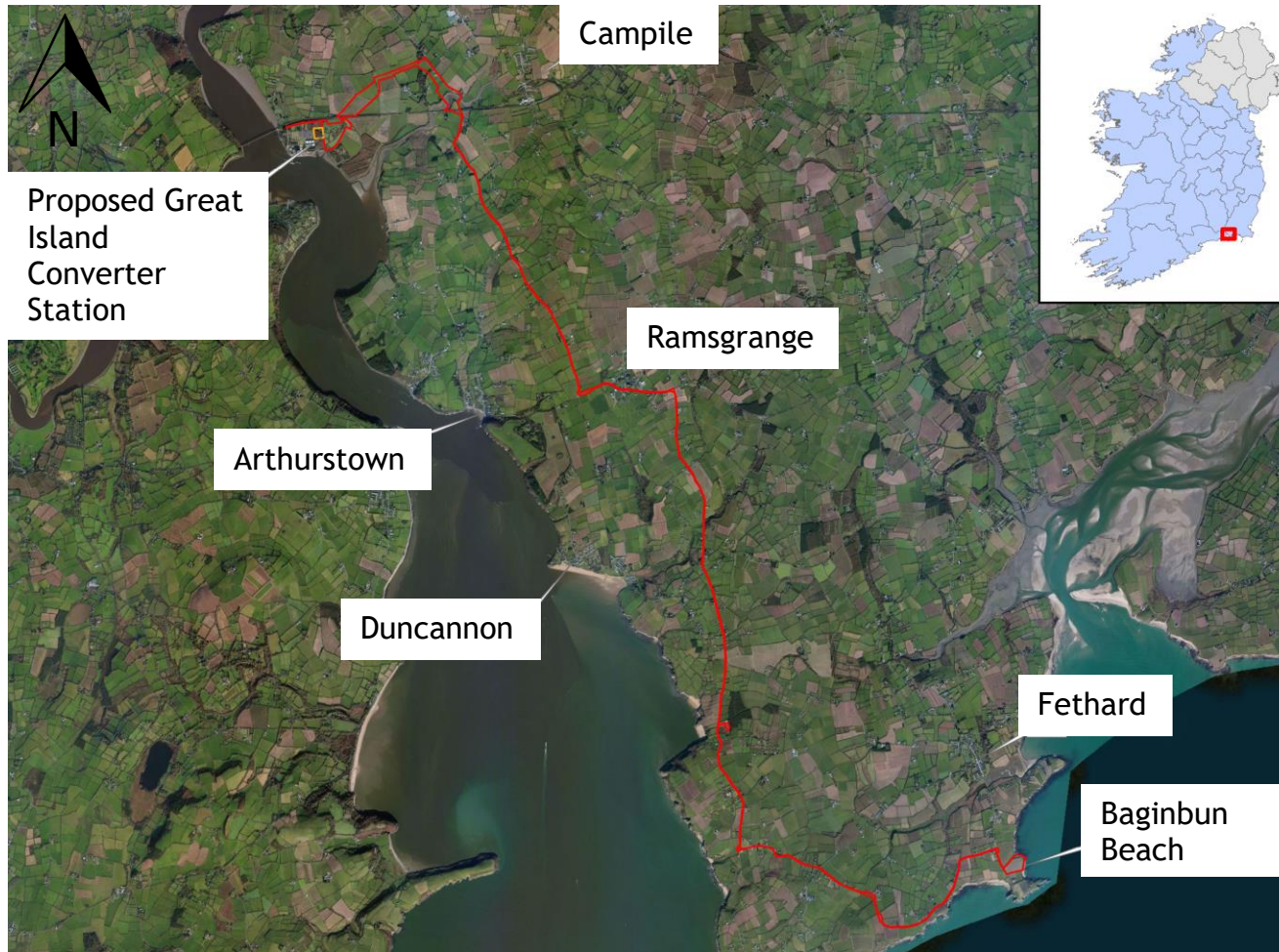
Figure 1.3: Overview of the proposed development | not to scale