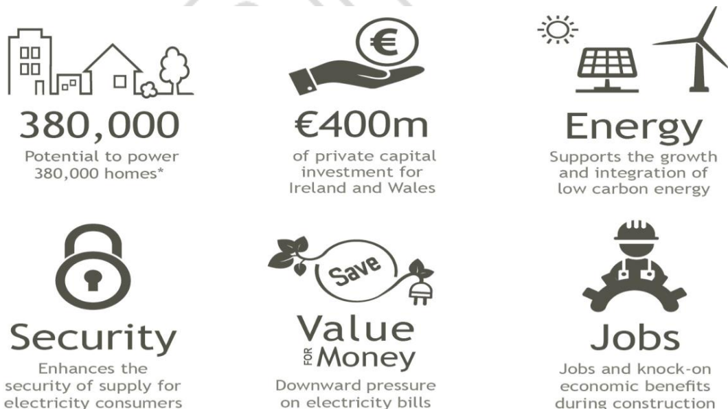
Figure 1.4: Potential benefits of the proposed development

The advantages likely to result from Greenlink are summarised in Figure 1.4 and explained below.