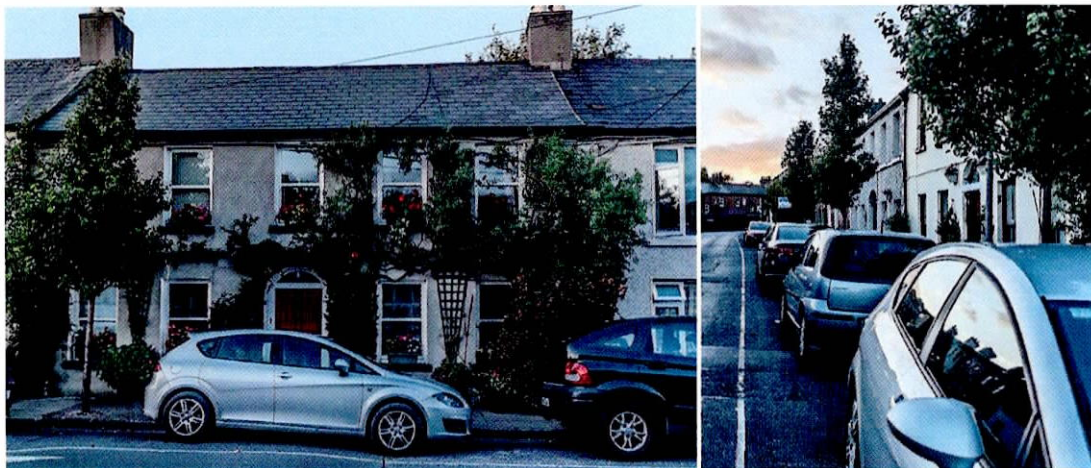
Images of community improvements & environmental efforts of upgrade, Monck Place

Bus Connects is a significant infrastructural project that has a clear logic to induce a more sustainable urban transport modal shift. I support the decarbonising of movement for the City's residents. In this observation I note that in tandem with the wider Bus Connects Objective, the protection and improvement of quality of local environments that are affected by the Bus Connects scheme is also paramount. Both objectives are mutually compatible and I support how the Bus Connects plan has managed these resolution of both as the relate to my local area.