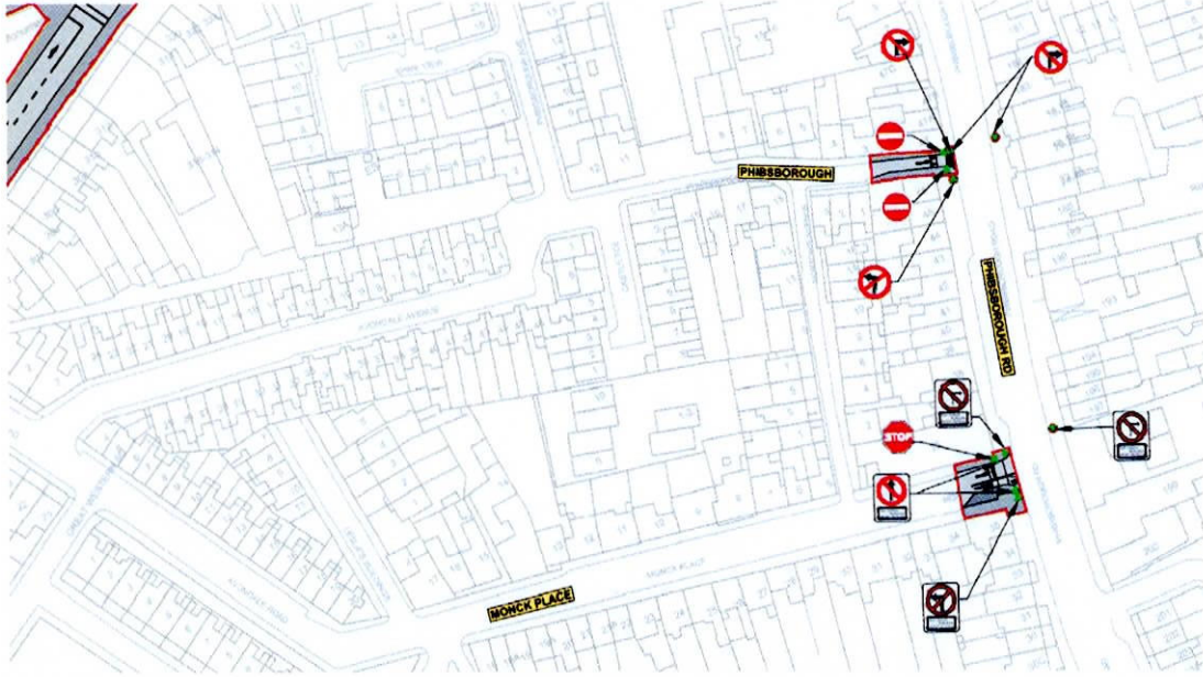
Extract of Bus Connects Plan to restrict traffic flow at Phibsborough Road, Monck Place & Avondale Avenue ('Phibsborough')

The roads at Monck Place, Avondale Road & Avondale Avenue have now been included in the Bus Connects scope of application, with proposed traffic movement restrictions now applied to these roads to prevent the future misuse of these roads for rat-running traffic: