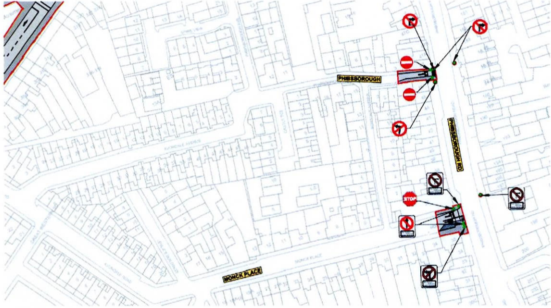
Extract of Bus Connects Plan to restrict traffic flow at Phibsborough Road, Monck Place & Avondale Avenue ('Phibsborough')

The roads at Monck Place, Avondale Road & Avondale Avenue have now been included in the Bus Connects scope of application, with proposed traffic movement restrictions now applied to these roads to prevent the future misuse of these roads for rat-running traffic: