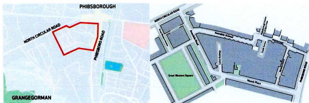
Red line Outline of environs of Monck Place, Avondale Road, Avondale Avenue, Leslie's Buildings and Great Western Square (left) and detail plan layout of streets (right)

The proposed alterations to vehicular traffic movement to the local network of streets in which I reside contained in the Bus Connects Blanchardstown to City Centre Core Bus Corridor Scheme reflect a resolution of my concerns.