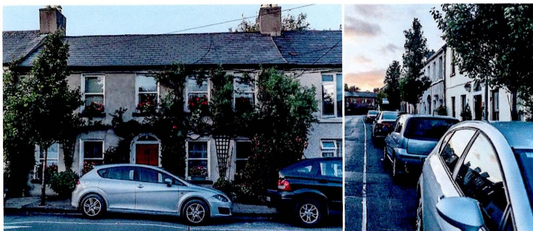
Images of community improvements & environmental efforts of upgrade, Monck Place

Bus Connects is a significant infrastructural project that has a clear logic to induce a more sustainable urban transport modal shift. I support the decarbonising of movement for the City's residents. In this observation I note that in tandem with the wider Bus Connects Objective, the protection and improvement of quality of local environments that are affected by the Bus Connects scheme is also paramount. Both objectives are mutually compatible and I support how the Bus Connects plan has managed these resolution of both as the relate to my local area.