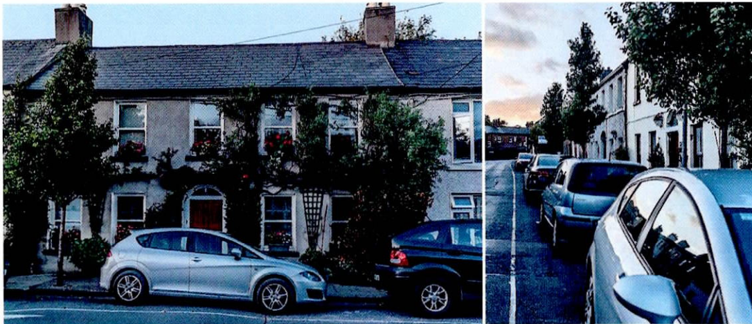
Images of community improvements & environmental efforts of upgrade, Monck Place

Bus Connects is a significant infrastructural project that has a clear logic to induce a more sustainable urban transport modal shift. I support the decarbonising of movement for the City's residents. In this observation I note that in tandem with the wider Bus Connects Objective, the protection and improvement of quality of local environments that are affected by the Bus Connects scheme is also paramount. Both objectives are mutually compatible and I support how the Bus Connects plan has managed these resolution of both as the relate to my local area.