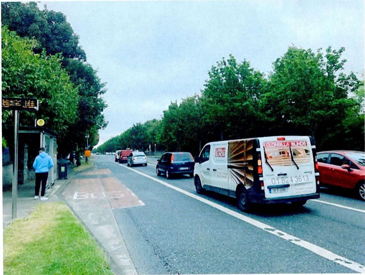
ENTERING NAVAN ROAD - TREE LINED ROAD FROM DR. 15.