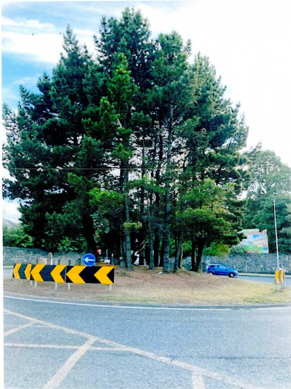
Ash Town Roundabout.