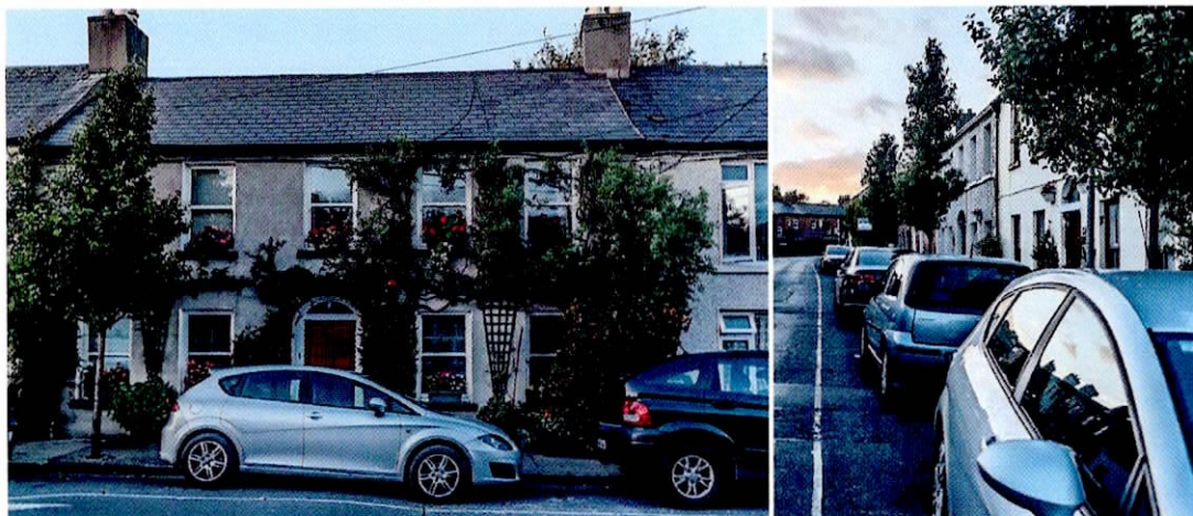
Images of community improvements & environmental efforts of upgrade, Monck Place

Bus Connects is a significant infrastructural project that has a clear logic to induce a more sustainable urban transport modal shift. I support the decarbonising of movement for the City's residents. In this observation I note that in tandem with the wider Bus Connects Objective, the protection and improvement of quality of local environments that are affected by the Bus Connects scheme is also paramount. Both objectives are mutually compatible and I support how the Bus Connects plan has managed these resolution of both as the relate to my local area.