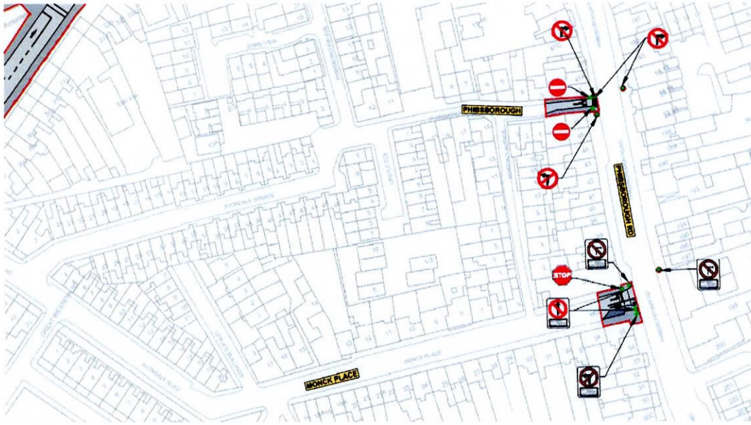
Extract of Bus Connects Plan to restrict traffic flow at Phibsborough Road, Monck Place & Avondale Avenue ('Phibsborough')

The roads at Monck Place, Avondale Road & Avondale Avenue have now been included in the Bus Connects scope of application, with proposed traffic movement restrictions now applied to these roads to prevent the future misuse of these roads for rat-running traffic: