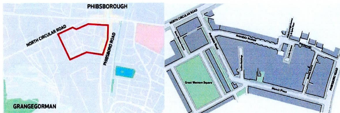
Red line Outline of environs of Monck Place, Avondale Road, Avondale Avenue, Leslie's Buildings and Great Western Square (left) and detail plan layout of streets (right)

The proposed alterations to vehicular traffic movement to the local network of streets in which I reside contained in the Bus Connects Blanchardstown to City Centre Core Bus Corridor Scheme reflect a resolution of my concerns.