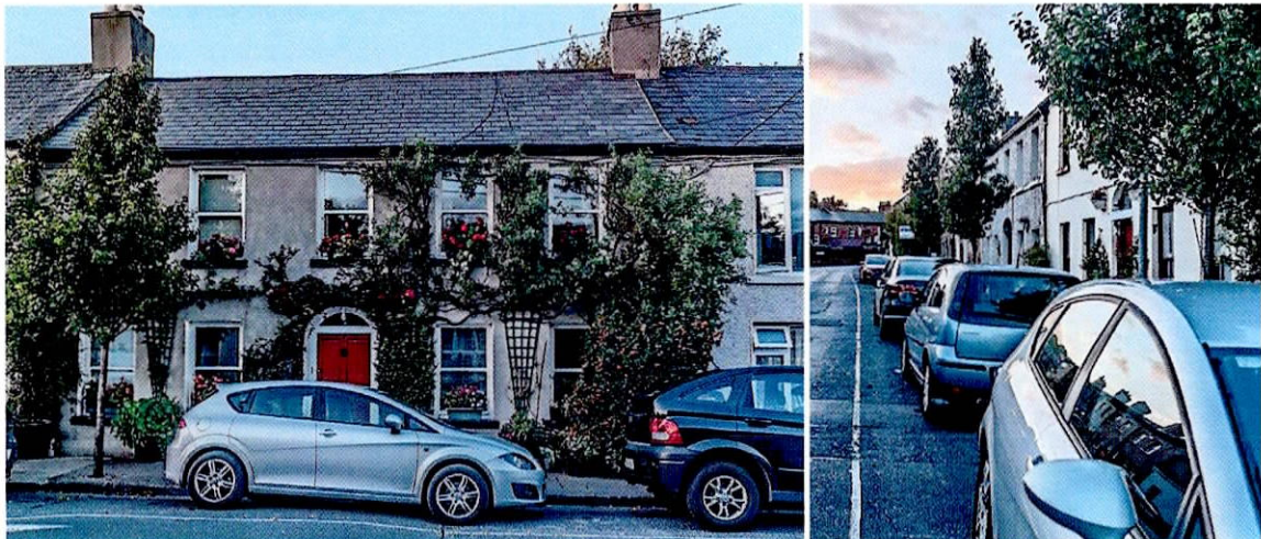
Images of community improvements & environmental efforts of upgrade, Monck Place

Bus Connects is a significant infrastructural project that has a clear logic to induce a more sustainable urban transport modal shift. I support the decarbonising of movement for the City's residents. In this observation I note that in tandem with the wider Bus Connects Objective, the protection and improvement of quality of local environments that are affected by the Bus Connects scheme is also paramount. Both objectives are mutually compatible and I support how the Bus Connects plan has managed these resolution of both as the relate to my local area.