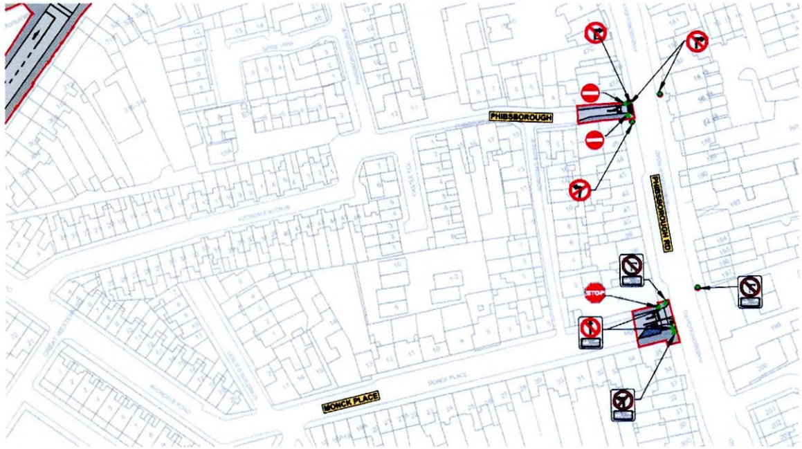
Extract of Bus Connects Plan to restrict traffic flow at Phibsborough Road, Monck Place & Avondale Avenue ('Phibsborough')

The roads at Monck Place, Avondale Road & Avondale Avenue have now been included in the Bus Connects scope of application, with proposed traffic movement restrictions now applied to these roads to prevent the future misuse of these roads for rat-running traffic: