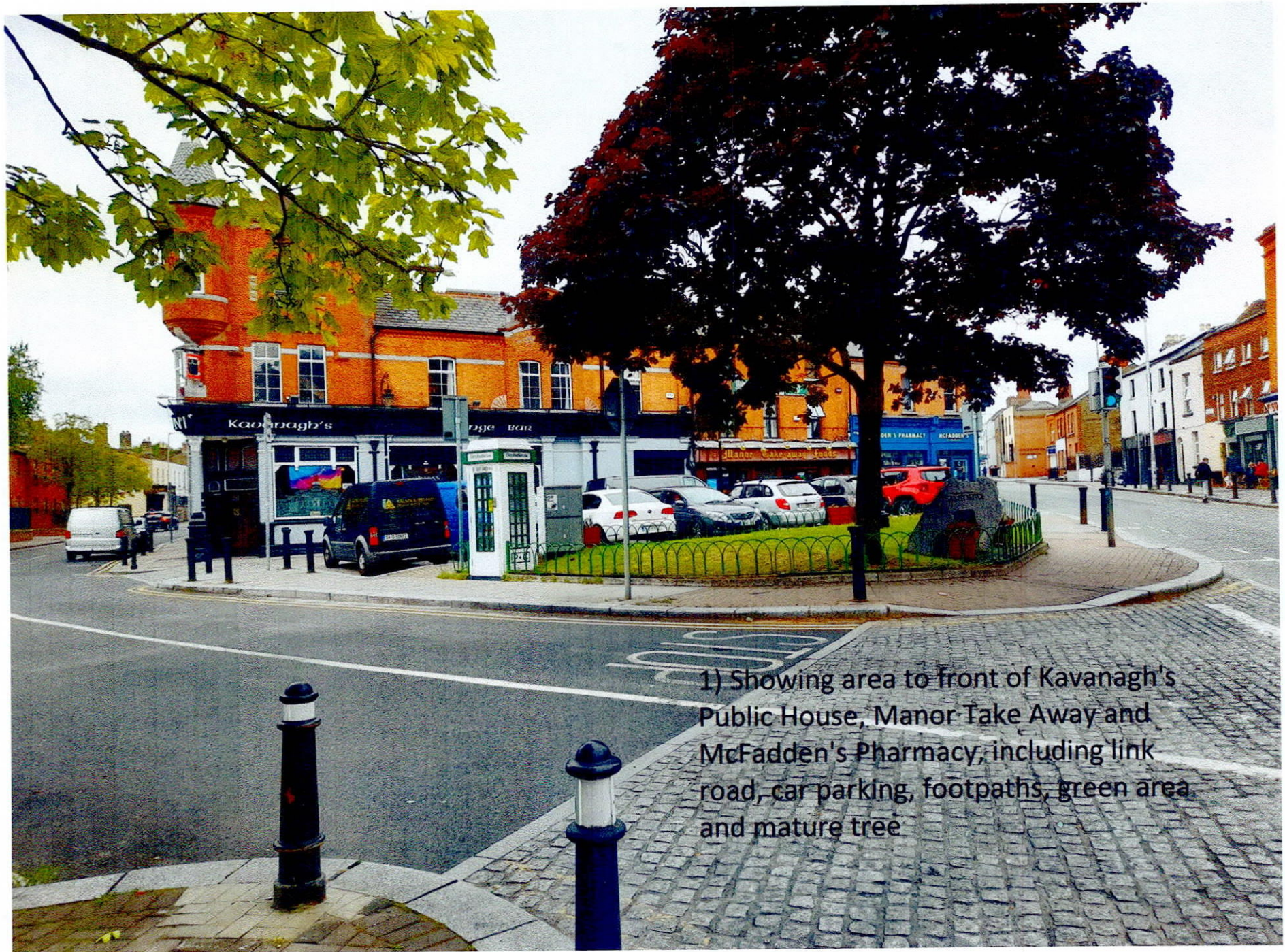
1) Showing area to front of Kavanagh's Public House, Manor Take Away and McFadden's Pharmacy, including link road, car parking, footpaths, green area and mature tree