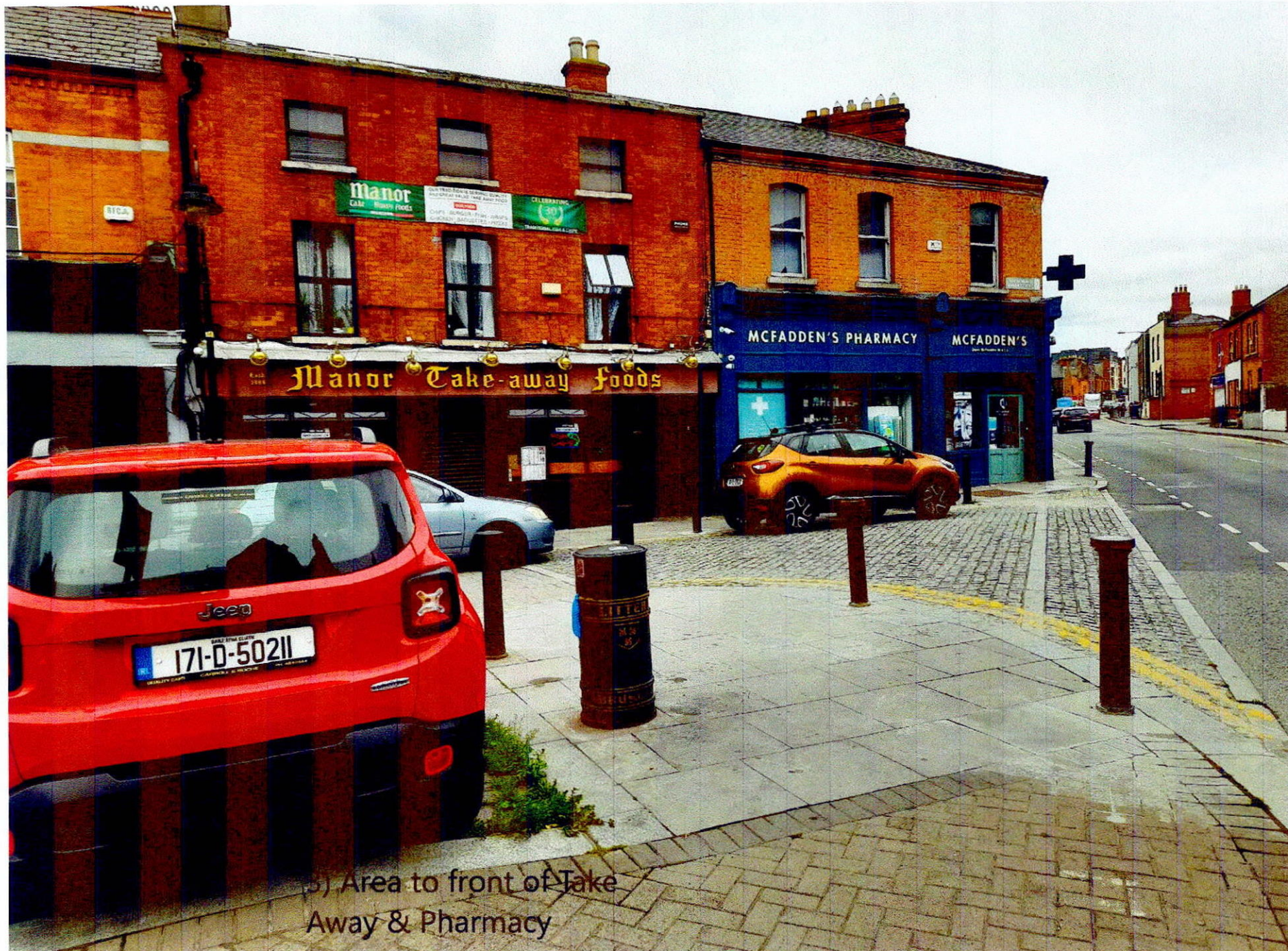
5) Area to front of Take Away & Pharmacy