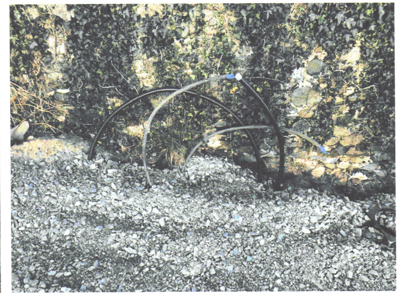
WATER MAINS PIPES