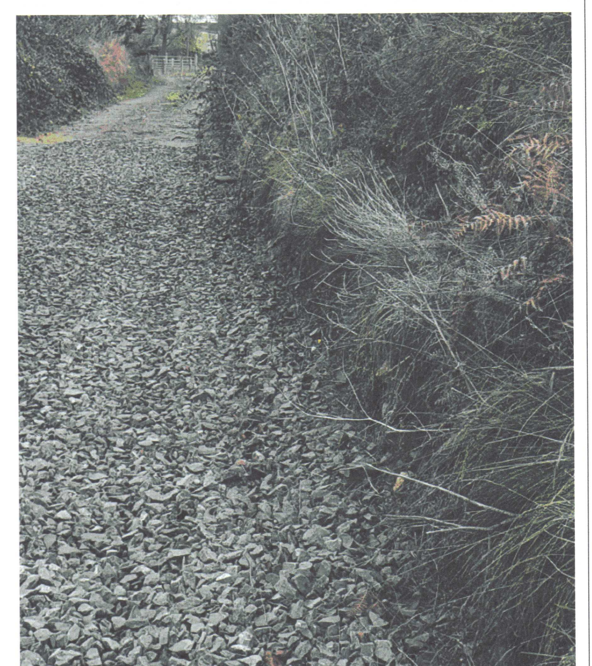
EXISTING GROUND CUT