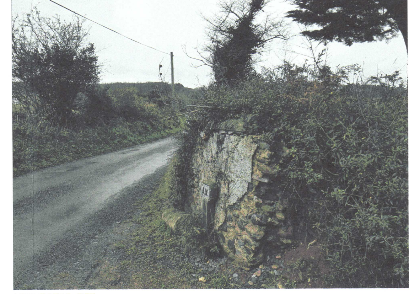
VIEW EXITING SITE

BM BYRNE + McCABE DESIGN architecture and engineering services UPPER MAIN ST. TEL: 0599725684 GRAIGNAMANAGH, CO. KILKENNY. FAX: 0599725684 E-MAIL: info@bmcodesign.ie