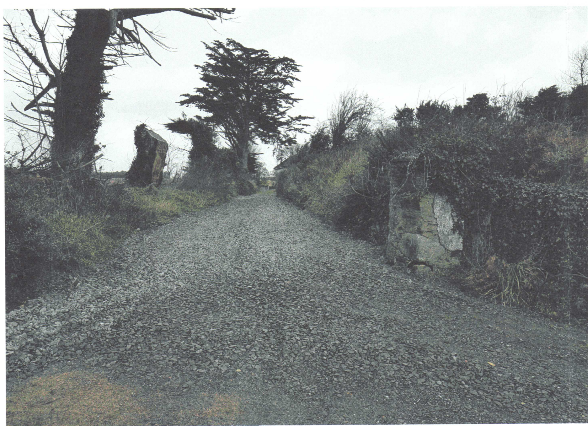
EXISTING ROAD CONDITION