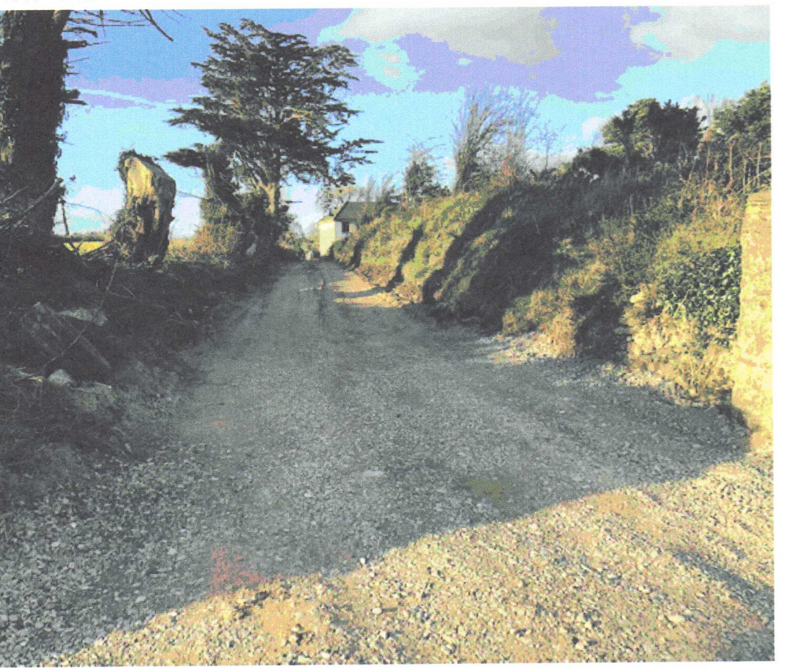
CARRIED OUT TO ROAD