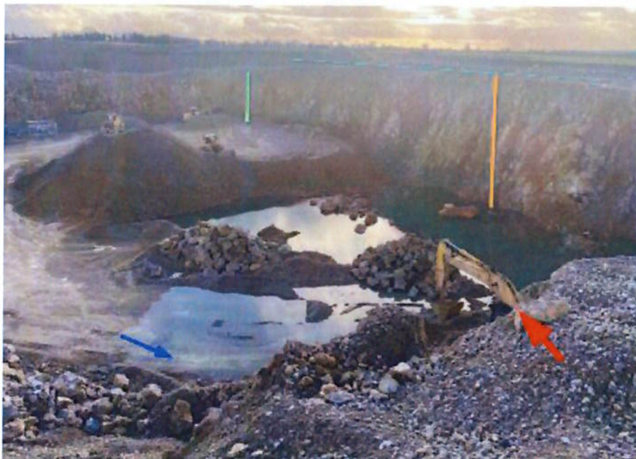
Photo 12: Recent work on-site. Note the differences in the bench heights – the digger (red arrow) is excavating rock from below the water (blue arrow shows tracks under the water). GREEN c. the bench-drop to the quarry floor, BLUE – tyre tracks, RED – digger down excavating, ORANGE c. bench-drop to the area being dug-out by the digger, CYAN line is the face[s] most recently drilled and blasted. (November 2020)