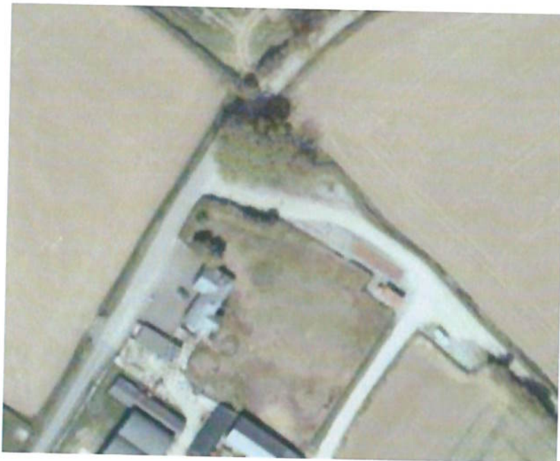
Photo 17: Entrance (early 2019, OSI orthophotography) showing office & weighbridge at that time