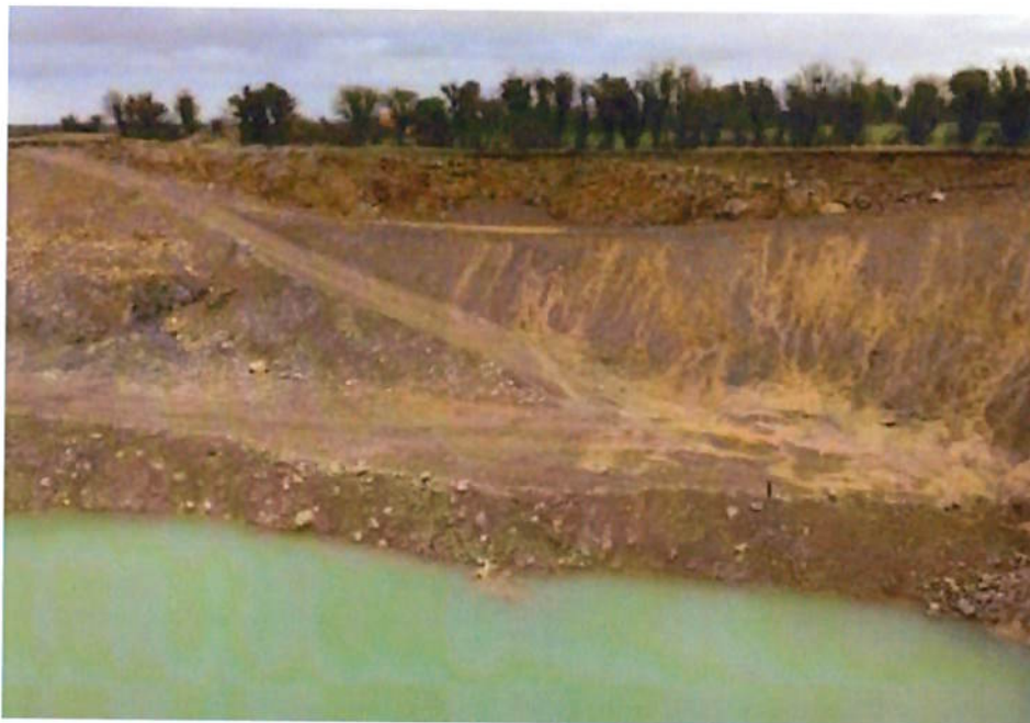
Photo 2: New entrance and haul roads, which were constructed on site. (2014)