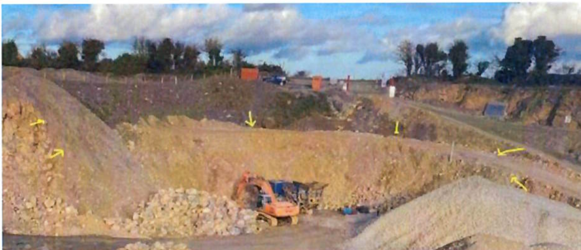
Photo 5: Further and additional construction works. Note all the area from and including that under fence all the way over to include all the entrance in the above photo is newly constructed ground. (November 2020)