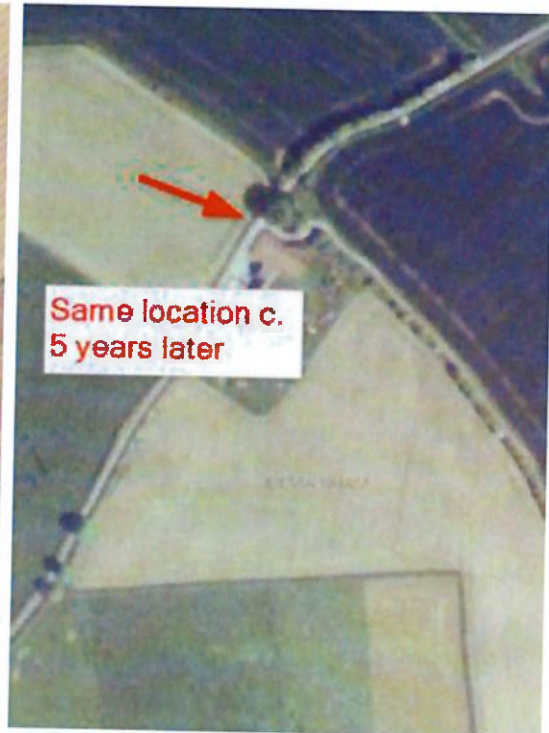
Photo 15 & 16: Entrance from the public road onto the laneway prior to any quarrying at Kilmainham by the developer. The changes are not unexplained in the planning documents. (2000, 2005 OSI orthophotography)