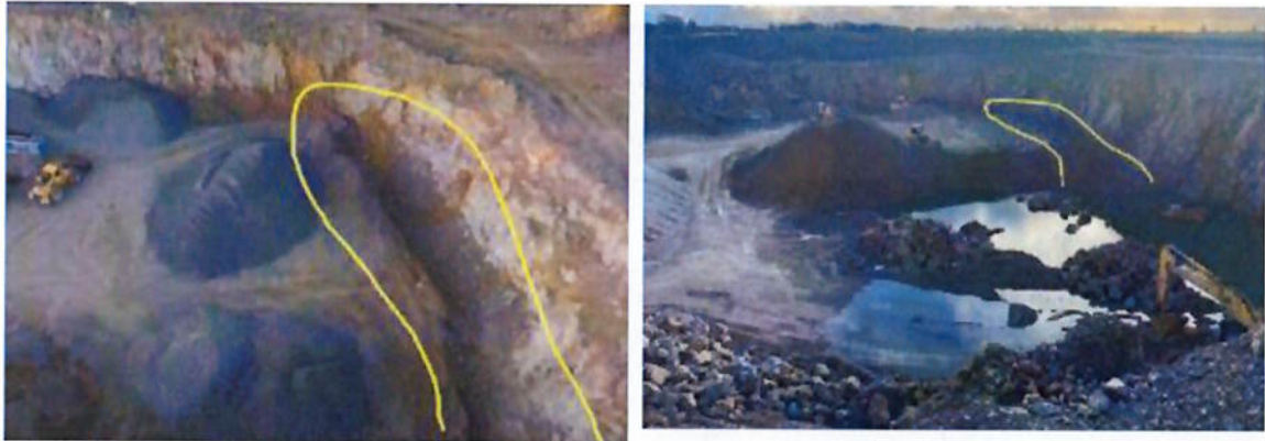
Photos 10 & 11: Note how the developer is digging out areas to considerably greater depths and then backfilling. If blasting to depths that aim to remain 2 meters above the highest water table this should not be possible. (November 2020)