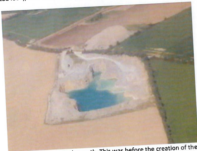
2014 Intact mound to the north. This was before the creation of the new entrance and backfilling that occurred within Folio LS2488F.

You requested a map at a scale of 1:500. A map to this scale requires a detailed topographical survey. We are NOT the 1 st or principal party in this reference and as a 3 rd party we do not have access to the lands to conduct such a survey. To assist you in your query, we do attach a site location map (on OSI mapping at a scale of 1:2500) upon which is marked the approximate location "C". See attached images only a part of the overburden was removed in 2014 (to backfill a new entrance into Folio LS2488F), without any remediation being carried out on the lands near "C" beforehand.