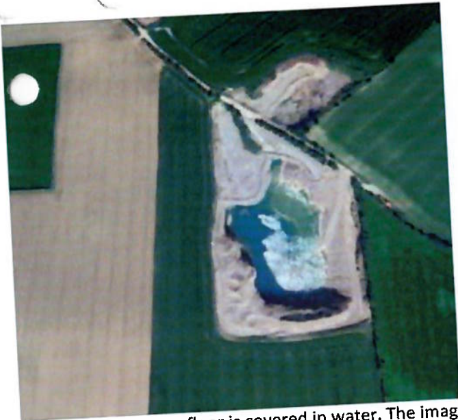
2016 – entire quarry floor is covered in water. The image shows the entire area after the creation of a new entrance backfilling. Haul roads are to the eastern side. The image also shows the overburden to the north after it has been partially removed.