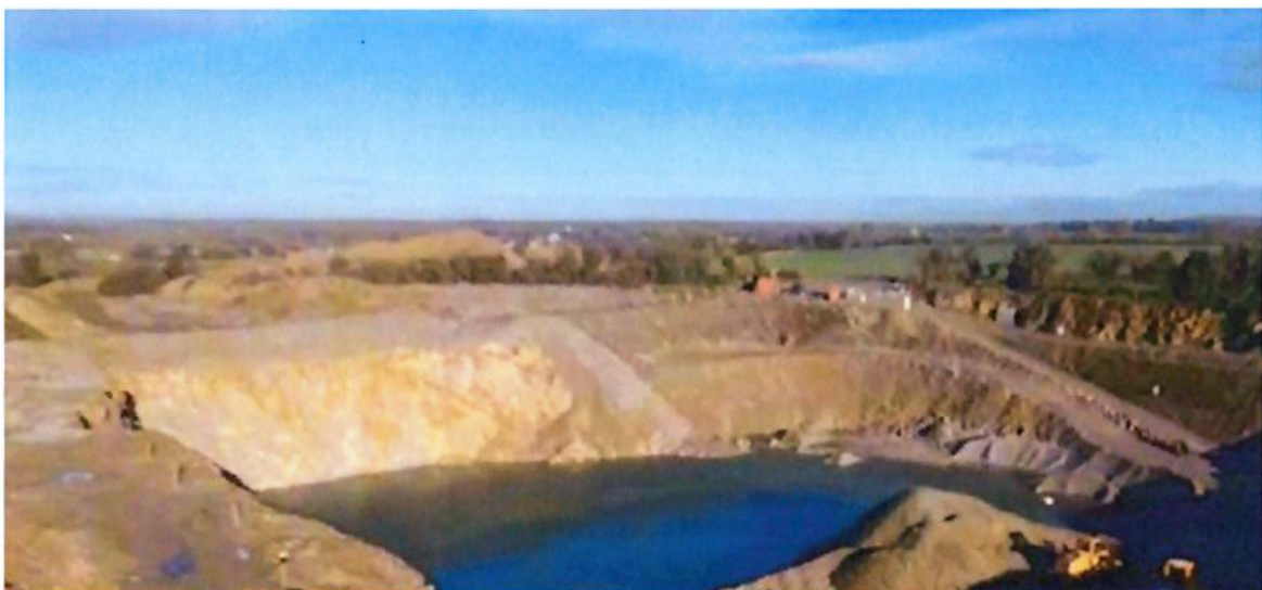
Photo 2. 2021 – the quarry floor continues to be removed some of the most recently blasted areas are currently resting under water.