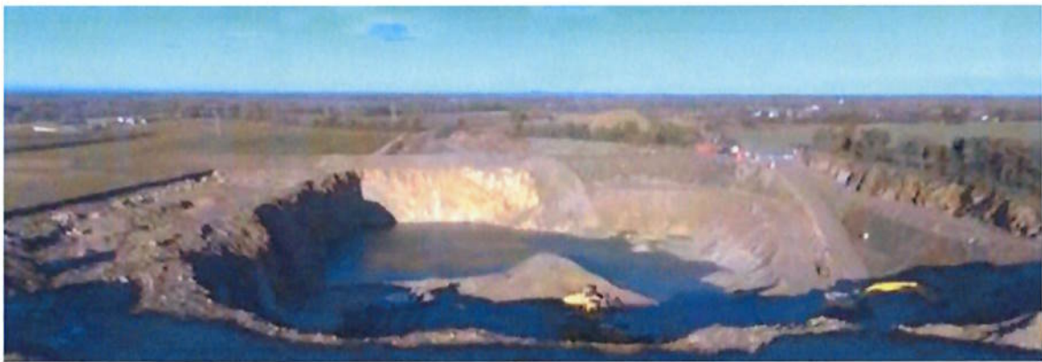
Photo 1. 2021 – image shows the western face [to the west] – this is where the most recent blasting occurred i.e., along the western and south-western faces. Note the construction of a further embankment or another haul road perhaps in front of the canteen, toilet area.

We refer you to the various aerial images provided to LCC that demonstrate significant water encroachment for all years 2012 – 2021 inclusive - application 08/943 nor its final grant did not at any stage address nor provide for any of this. This is 2021 there is no change regarding the presence of exposed water, which has been excavated below that specified in the final grant.