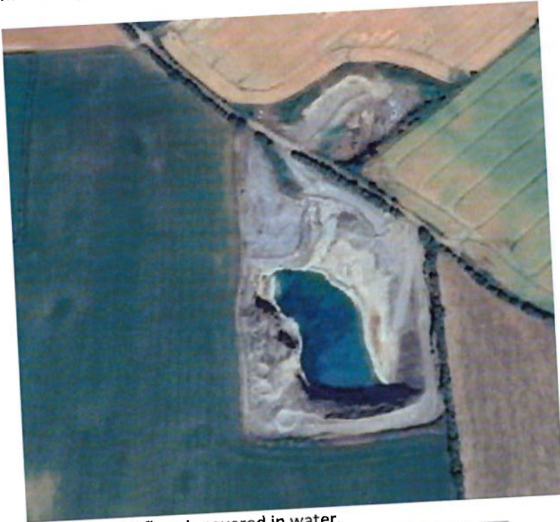
2018 – quarry floor is covered in water.