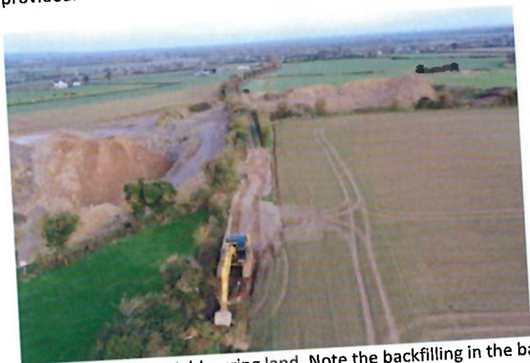
2019 – Digger in neighbouring land. Note the backfilling in the background and the partially removed stockpile of overburden – it was hauled from to backfill and create the new entrance and haul roads.

As we understand it the machinery has been stored continuously and extending over many years from 2014-2020 inclusive. See the presence of machinery resting on the neighbouring lands during this period in the images provided.