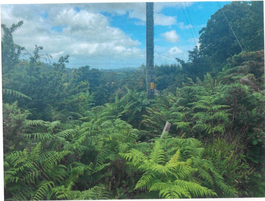
Image 13 - View from Ballyreagh Public Road (Impeded by Trees and Hedgerow)