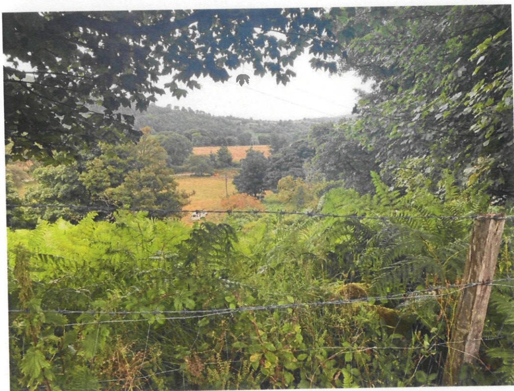
Image 12 - View from Ballyreagh Public Road (Impeded by Trees and Hedgerow)