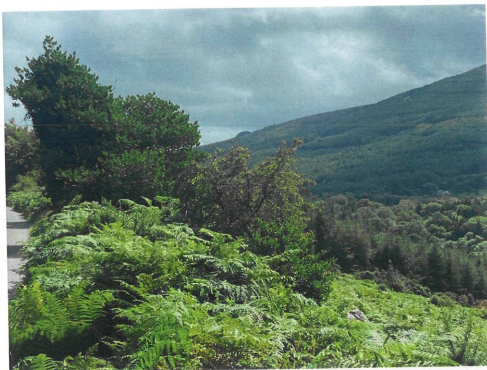
Image 11 - View from Knockree Hostel Road Looking South East (Impeded by Trees and Brush)