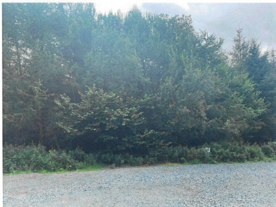
Image 6 – View South from Knockree Coillte Car Park (Impeded by Trees)