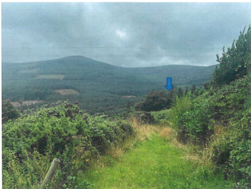
Image 5 – View Southwest from Knockree Hostel to Approx Agricultural Shed Location (Impeded by Trees)