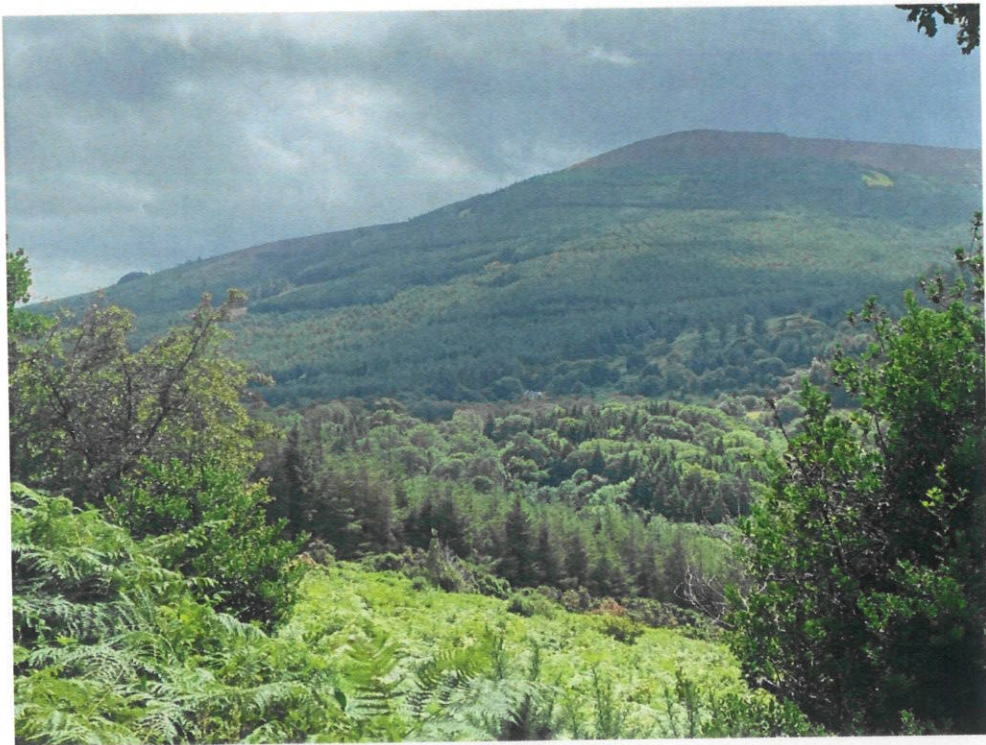
Image 10 - View from Knockree Hostel Road Looking South East (Impeded by Trees and Brush)