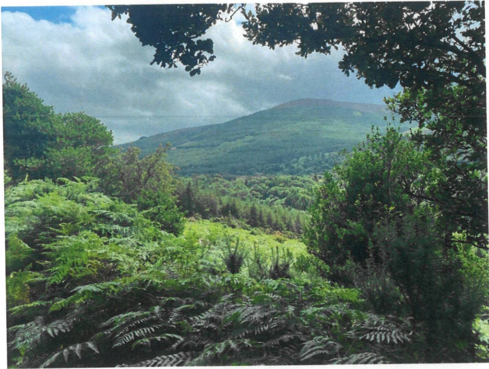
Image 9 – View from Knockree Hostel Road Looking South East (Impeded by Trees and Brush)