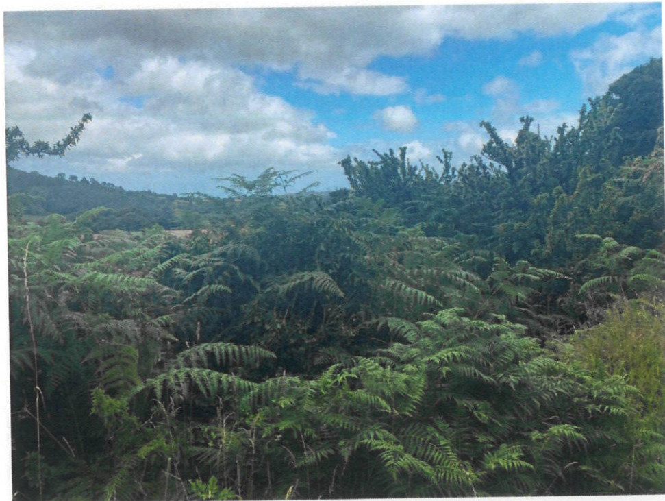
Image 14 - View from Ballyreagh Public Road (Impeded by Trees and Hedgerow)