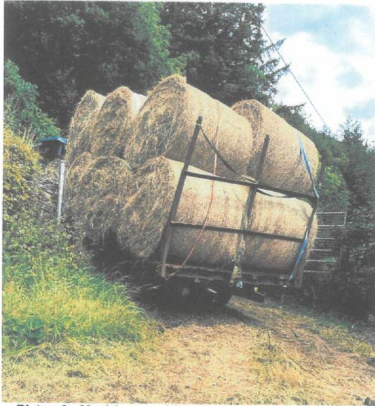
Picture3 : Machinery exiting entrance on sloped ground